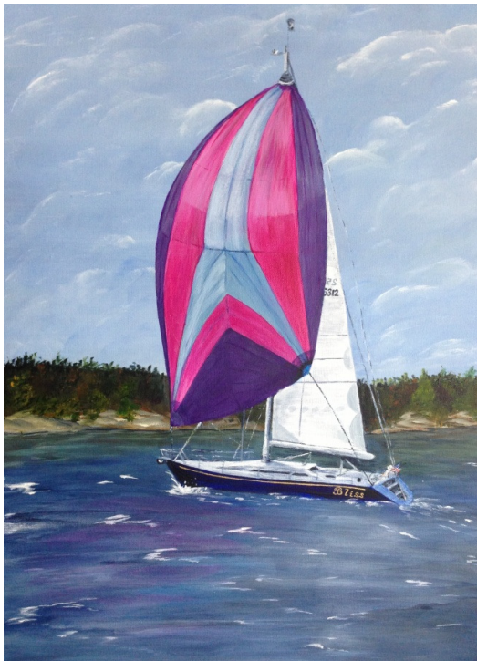
Sheer Bliss (a C&C 51)