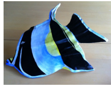
Moorish Idol (Palm Frond)